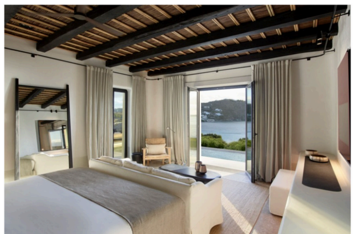
"We tried to use a very sophisticated dark palette of materials that come in a real contrast with the pure blue of the sea," says interior designer Vangelis Bonios.