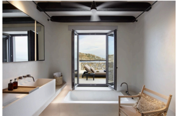
The resort's prime hilltop location give guests remarkable views to the east and west.