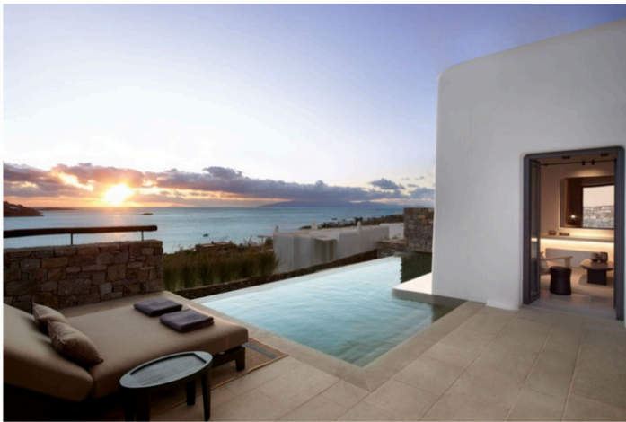
Each of Kalesma's suites and villas comes with its own heated plunge pool.

Mykonos's bottle-service din is giving way to a more considered vernacular, one that prizes materiality, craft, and a deliberate point of view. Perched on a hill above Mykonos Town, the newly debuted Anandes Hotel , designed by Studio Bonarchi, boasts custom lighting by Philippe Anthonioz, original works by Richard Serra and Thomas Houseago, and a tactile mix of local stone, pine, and linen. (Bonarchi also crafted the spectacular spaces at Kalesma , which is set to debut an expansion featuring more waterfront villas.) The hotel's Riviera-inspired restaurant, La Petite Maison, lends a subtle swagger with "tomatinis" at sunset and salt-baked sea bass framed by unobstructed views of the island's famous windmills. Nearby, Soulmates , the island's new terrazzo-clad aperitivo bar by Studio Kisko founder Fragkiskos Sarris, turns a former utility lot into a laid-back ritual space, capped with Christina Mandilari's ceiling mural—a swirling homage to the island's marine life and refracted light.