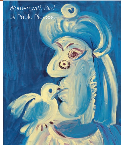
Women with Bird by Pablo Picasso

Courtesy Images; From Top: The National Gallery, London; The Estate of Mick Wallingkarri Tjakamarra, licensed by Aboriginal Artists Agency/Copyright Agency, Australia; V&A South Kensington; Succession Picasso/Copyright 2024/Marc Dornage © FABBA