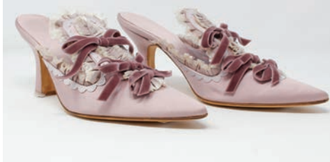
Antoinette, 2005 by Manolo Blahnik

To celebrate its bicentenary, London's National Gallery hangs C C Land: The Wonder of Art , a once-in-a-generation redisplay