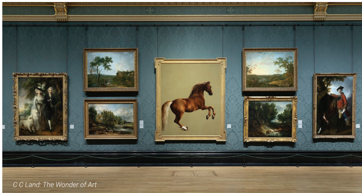
C C Land: The Wonder of Art

To celebrate its bicentenary, London's National Gallery hangs C C Land: The Wonder of Art , a once-in-a-generation redisplay