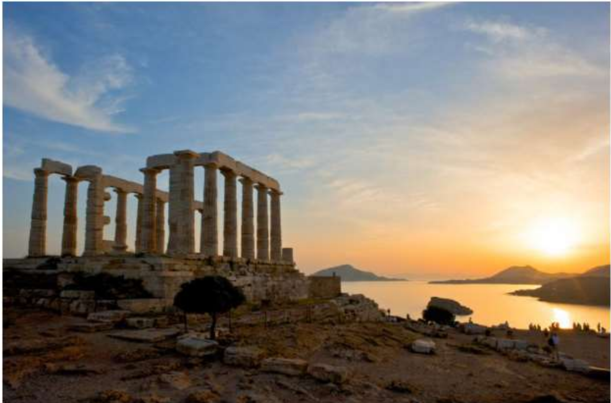
Construction on a grand Temple of Poseidon began around 500 BC but was never completed.

It started in March. That month, Emirates announced that it would introduce new routes between Newark, N.J., and Athens; soon after, a handful of cruise lines said they'd start sailing the Greek Isles in June. It was a harbinger of good news to come—inspiring enough confidence to send airfare and hotel searches from the U.S. to Greece through the roof. As a result, airfare booking site Hopper tracked a 75% spike in round-trip searches, and luxury agency Virtuoso tallied a 225% jump in new hotel reservations across the mainland and Greek isles.