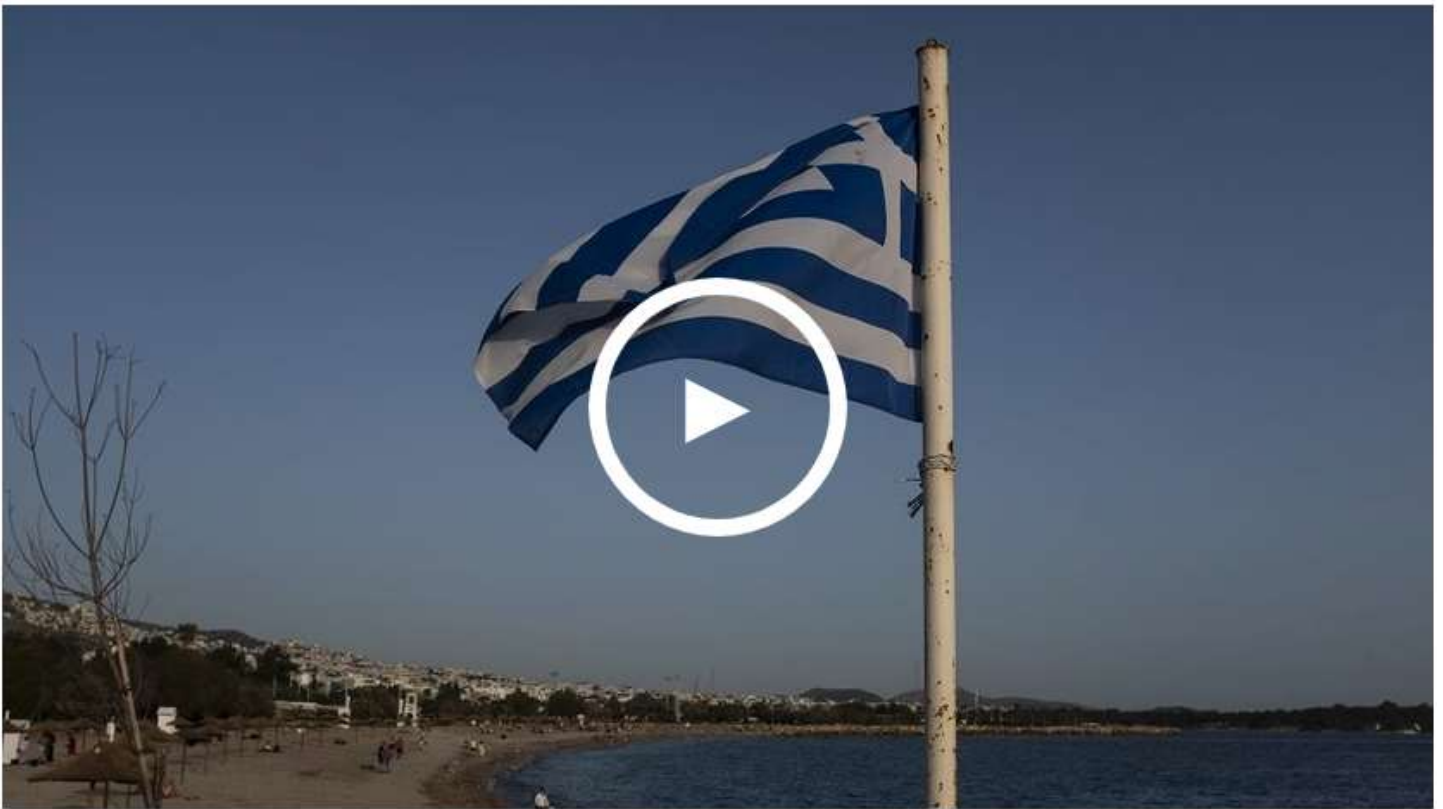
Greece Opens Doors to Tourists

Even before Greece announced on April 19 that it would be the first European country to welcome Americans—including unvaccinated ones —demand for summer trips to the Aegean was soaring.