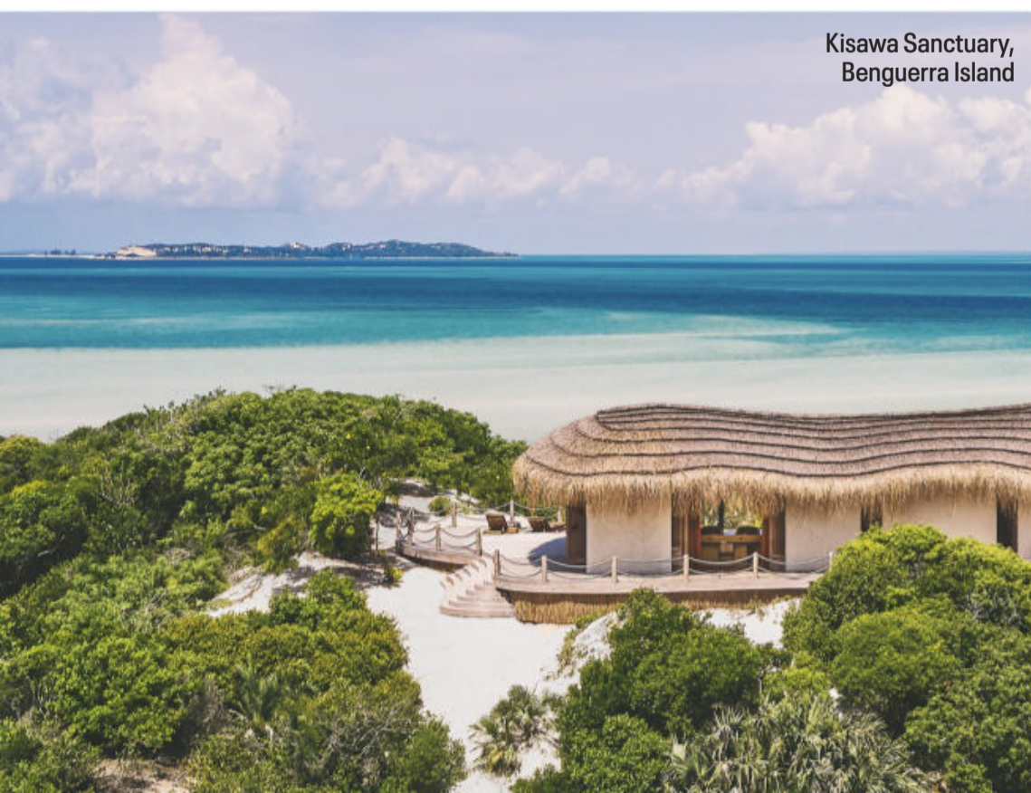
Kisawa Sanctuary, Benguerra Island

Nayara Bocas del Toro, Panama The country’s wild side is one of its big draws, and this solar-powered hotel in the astoundingly biodiverse Bocas del Toro Archipelago has ➡➡