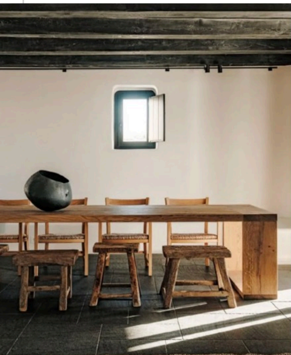
FROM TOP: One of Kalesma's white-washed structures; Studio Bonarchi and K-Studio collaborated on the interiors; a panoramic view; accommodations have a Cycladic aesthetic.