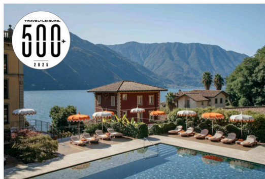
One of three pools at the Grand Hotel Tremezzo, a T+L 500 property located on Italy's Lake Como.

An extraordinary setting. Design that feels both unexpected and of-the-moment. Service that goes above and beyond. When a hotel feels truly exceptional, our readers are slow to forget.